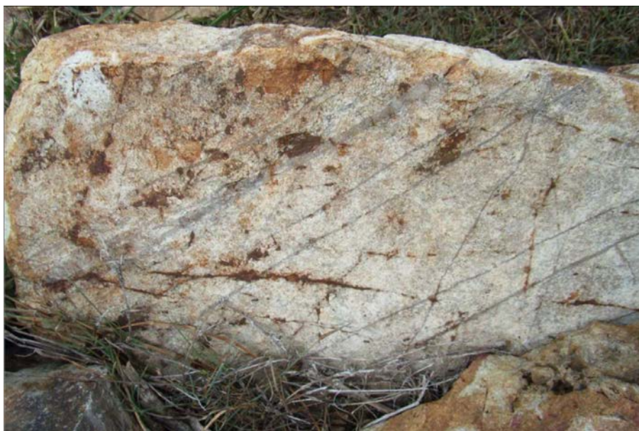
Figure 3: Photo 2 taken by past exploration of porphyry-style gold mineralisation near previous drilling (PK1) which intersected 38m @ 0.46g/t Au from 14m. Location shown in figure 2.