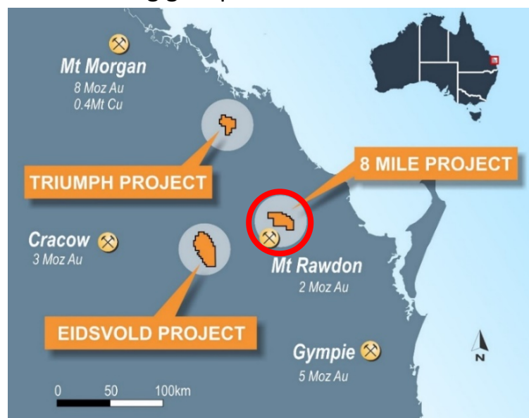
Figure 1: Metal Bank project locations.